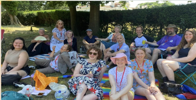
Schoolgirls/ Villagers played by The Company

Pilot played by Buf —This is Buf's first appearance onstage. We hope she will be sufficiently pleased with the treats on offer to play her part! She finds her full name of Lighthouse Aussies Dancing Queen too pretentious to use.