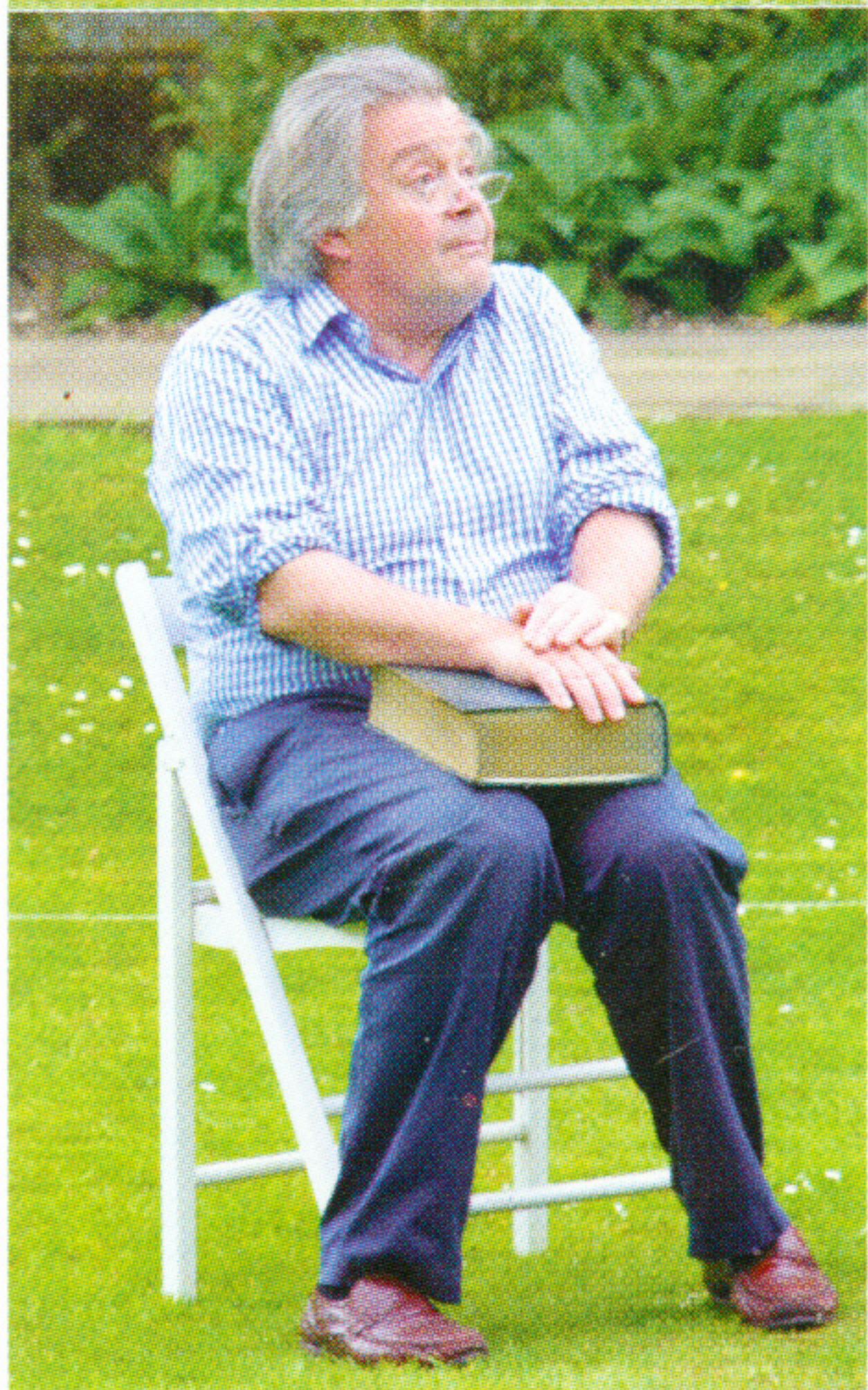
Rehearsal Photos by Clive Weeks