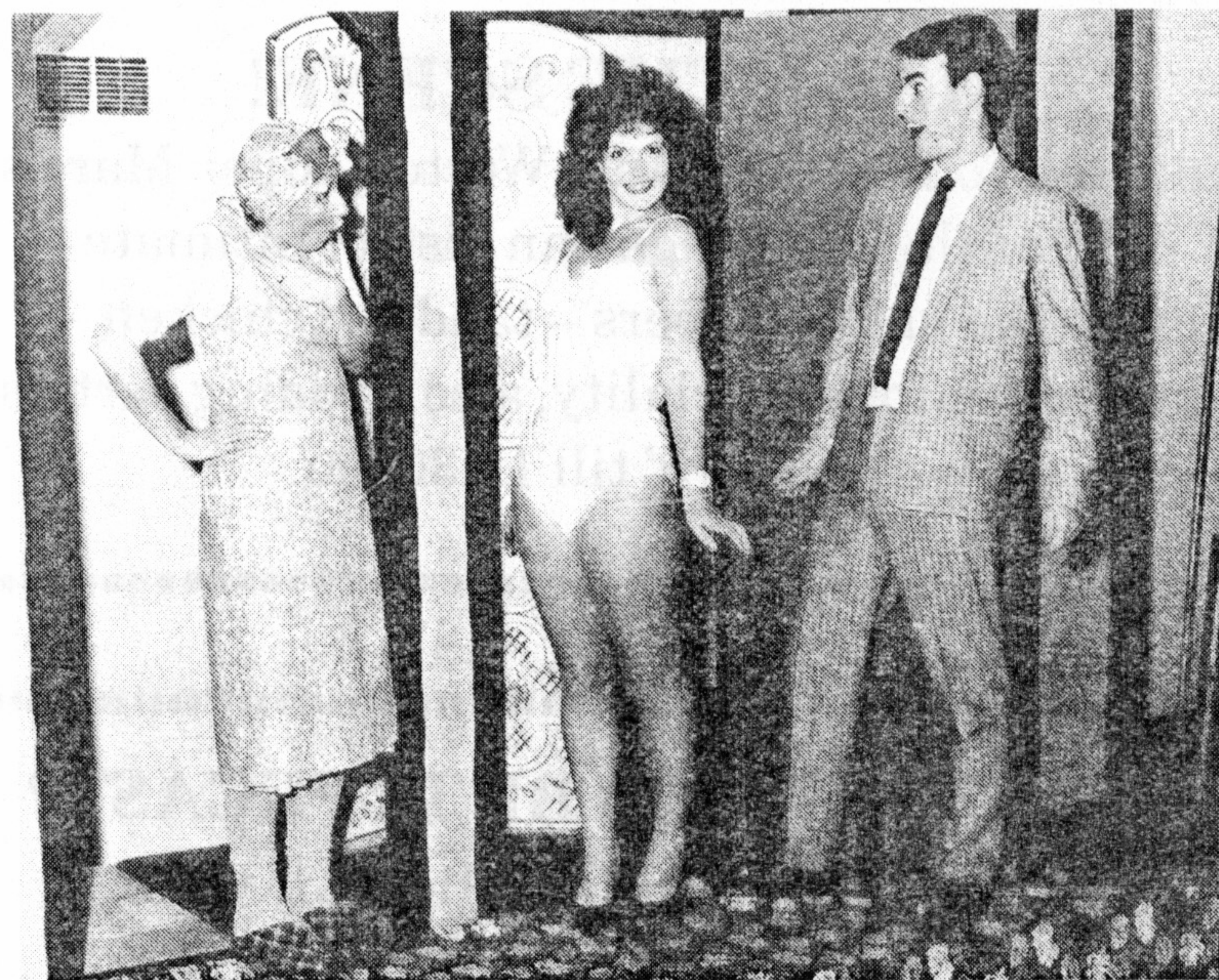
Scenes from this week's attraction.

YOUR LEADING LADY tonight or any other night, from West of England Escorts. Ring 4322, and let one of our charming hostesses show you the high spots of Weston-super-Mare, Burnham-on-Sea, and Yatton.